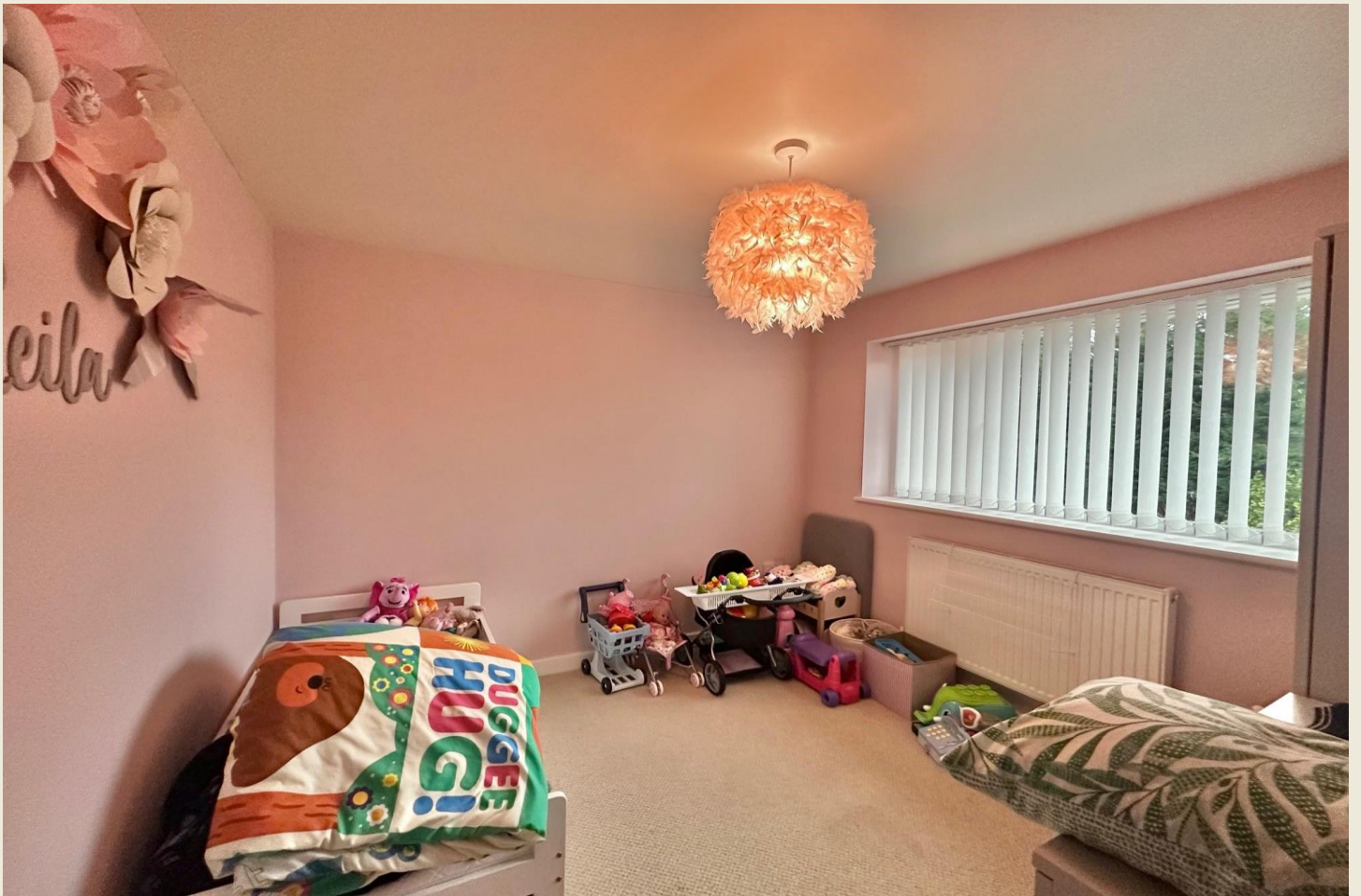
BEDROOM TWO 9'5 x 8'11