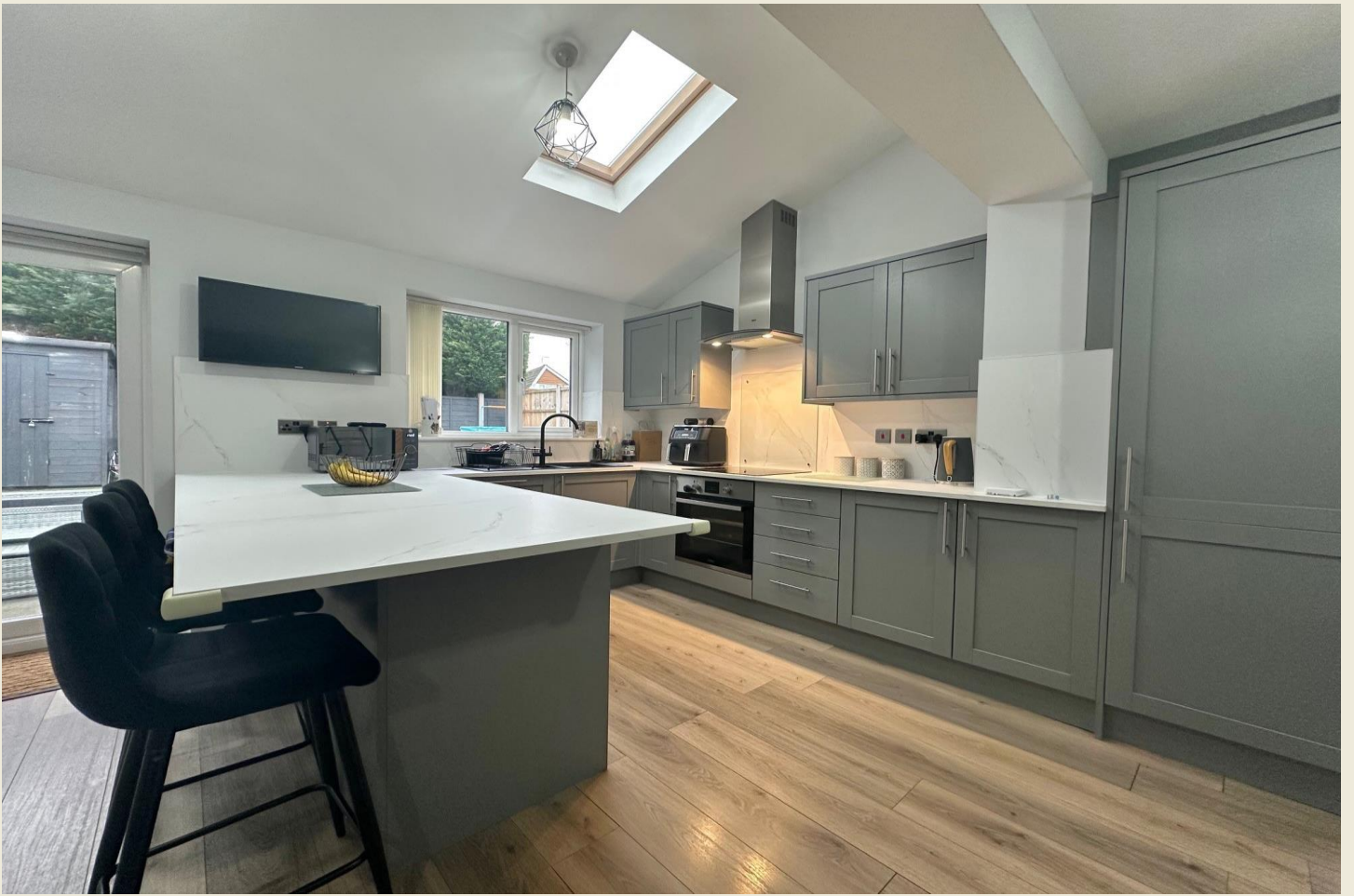
KITCHEN DINING FAMILY ROOM 18'0" reducing to 15'10" x 15'3"